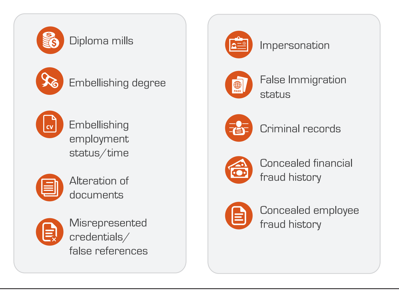
Figure 2. Sources of misrepresentation by some applicants.<sup>20</sup>

or contracted to a hospital. Other health care practitioners include those such as pharmacists, pharmacy technicians, nurse midwives, surgical assistants, physical therapists, nutritionists, radiographers, laboratory technicians, perfusionists, respiratory therapists, or emergency medical care specialists. In some countries, practitioners such as those who provide services such as herbal medicine or acupuncture also fall under this category. Primary source verification applies only to those professionals who work or practice in the hospital.